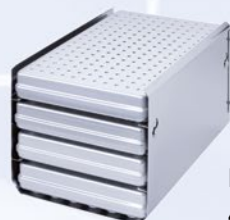
Mount >B< for 4 standard tray cassettes (or for 4 trays)