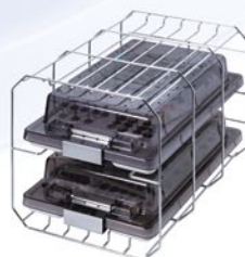
Mount >D< for 2 high cassettes (i.e. implantology trays)