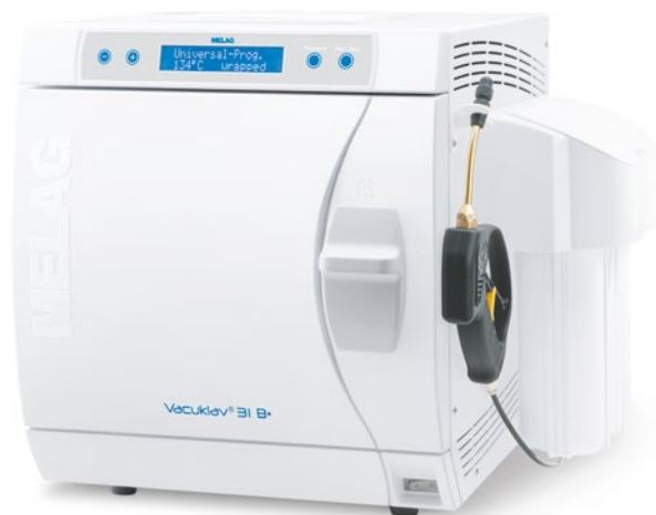
MELAdem®40 mounted on the Vacuklav® 31 B+

Operating the autoclaves should be both pleasurable and safe. The design fully supports this demand. It shows what's essential, and does its work efficiently. The large door lock is not only a design feature, but also ensures a safe and easy opening and closing of the door.