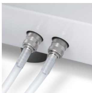
quick release connector

The large integrated funnel-shaped opening of the water storage tank makes it easy to fill the tank with demineralized or distilled water in the Vacuklav® 31 B+ and Vacuklav® 23 B+. Alternatively, both autoclaves could be fed the required water supply from any external reserve container or even be connected to a water treatment unit.