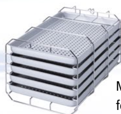
Mount >A< for 5 trays

The autoclaves are always delivered with a mounting for trays or cassettes, included in the price. The delivery contains Mount >A< (for 5 trays or 3 standard tray cassettes) by default. Please indicate in your order if you would alternatively at no extra charge prefer Mount >B< for 4 standard tray cassettes or Mount >D< for two high cassettes e.g. implant cassettes or container systems.