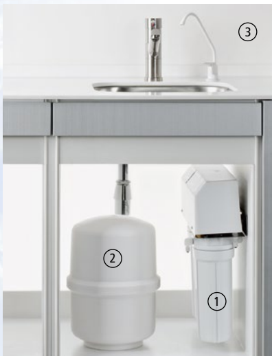
MELAdem®47 (1) installed in a sub cabinet with water tank (2) and tap (3).